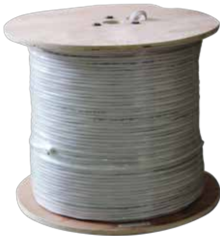
Coaxial RG-59 - 300M